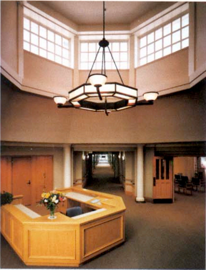
Top: the complementary towers of the chapel, rotunda, and dining room signify the major collective spaces of the infirmary. Above: a view of the rotunda, with the entrance to the chapel at the right.

An architect immersed in theology provides insight into the formal and material traditions of sacred space.